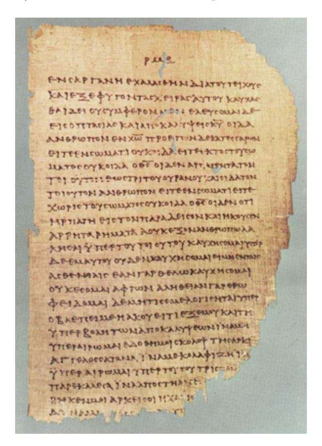
Folio from Papyrus 46 | Public Domain

here and there (as this is only human). However, all things being equal, there is a general presumption that earlier manuscripts are more likely to pass on the original reading compared to later manuscripts because of the simple fact that, over time, there is opportunity for more and more transcription errors to creep in.